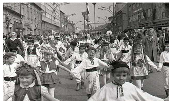
Figure 1. Presentation of the children's folklore

These are undoubtedly the May 1, 1918, which was the day when citizens of Liptovský Mikuláš registered better working conditions and the right of the Slovak nation to selflessly demand the creation of the Czechoslovak state. It was a brave and significant step. The Mayor of the City emphasized that the remembrance of this important date in our history is to be a social, not a political event. (Figure 1)