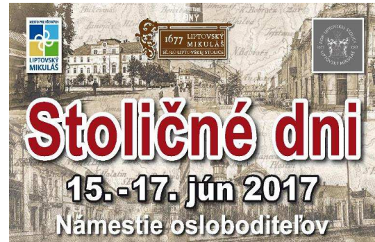
Figure 6. Invitations on Session Days

Stoličné days. This year's celebrations were celebrated in the spirit of the anniversary of the Liptovská stolice, because 340 years ago (June 14, 1677), Juraj Ilešházi proposed that the town hall of Liptovský Svätý Mikuláš should become the seat of the churches.