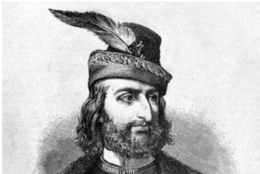
Figure 8. Matej I. Korvín

Matej I. Korvín did not miss the accompaniment, (Figure 8) Hungarian and Czech king.