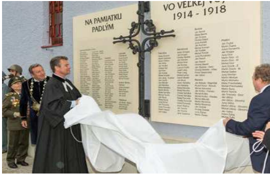
Figure 2. Memorial plaque

for the rest of their lives. In the great war of 1914 - 1918, a table at the evangelical church with names of those who have never returned from this war has been revealed on the memory of the fallen in the Great War (Figure 2)