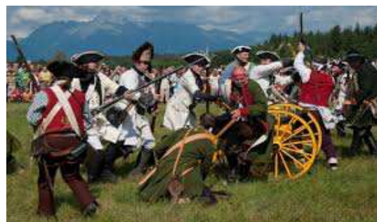
Figure 9. The Kuruky hornoliptov regiment