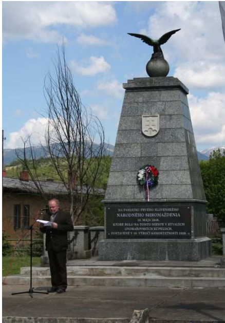
Figure 5. The Memorial of the Slovak Nation in Liptovská Ondrášová

Hungarian government of Prime Minister Batthyányi and the Hungarian Parliament in Pest. They have formulated them in 14 major national points.