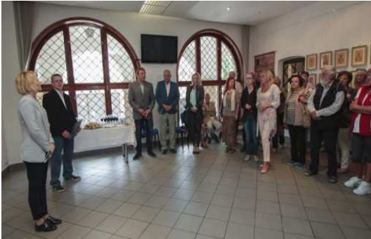
Figure 10. Exhibition Hall of the Janka Kráľa Municipal Museum

The Last Day of Sagittarius (August // 2017, p. 10) closed the mini-football tournament of high school students, coupled with the Mini League's assessment of Basketball for elementary school pupils.