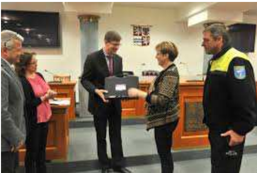
Figure 11. Rescue Defibrillator

Increasing the pride and awareness of Mikulášanov to his city is also that our city has captured the European trend of defibrillator placement (Figure 11) in areas where there is a higher concentration of the public. Liptov belongs to the most visited regions of Slovakia.